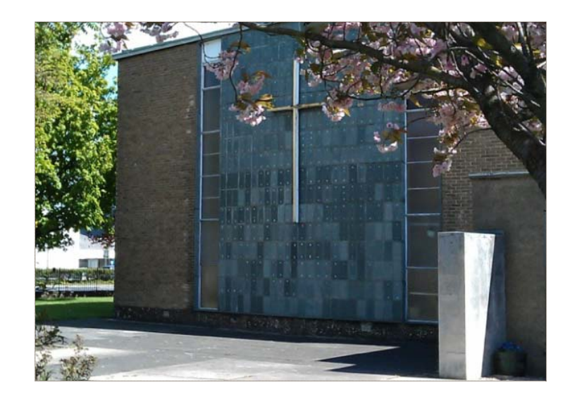
St Nicholas Parish Church, Sighthill 122 Sighthill Loan Edinburgh EH11 4NT

Come and say hello at St Nicholas Church We would love to see you